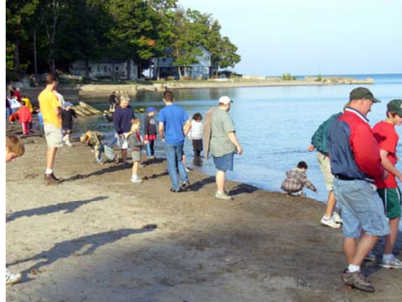
Skipping rocks on lake Erie