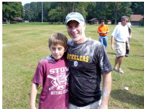
After the carnage, Pals Forever, again!