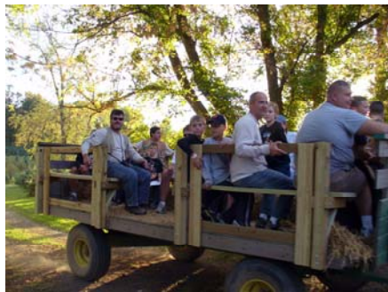
Some Hayride fun around the Heritage Farm