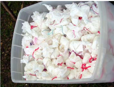
Flour-bombs ready for action